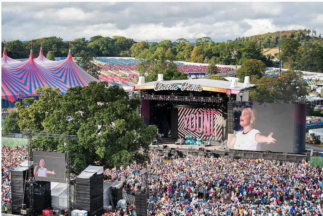
The picture shows a performer from the main stage at Electric Picnic 2023