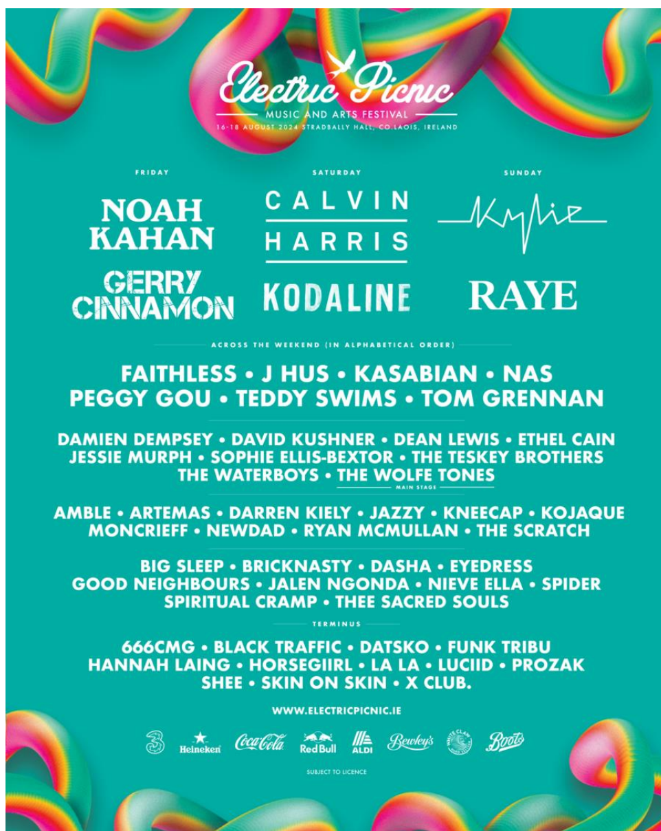
Image shows the lineup for Electric Picnic 2024

This accessibility guide, in Microsoft Word format, is available to download from the Electric Picnic Festival website but can also be viewed by picking up a returnable copy from the accessible campsite and arena information hubs. Please visit the Electric Picnic website .