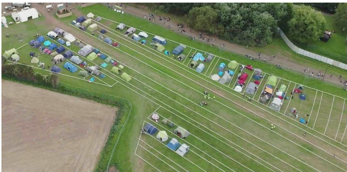
The image shows a field with tents in lines from a Live Nation Festival in 2023.

Following a successful launch in 2023, the accessibility campsite is marked out in lines providing 4x4 metres of space per tent. Tents must be pitched in parallel rows within a pre-allocated pitch size, kept in line by marked lanes that keep the fire lane and path to your tent clear to ensure you can move freely around the campsite. The campsite staff will guide you to the next available space on arrival.